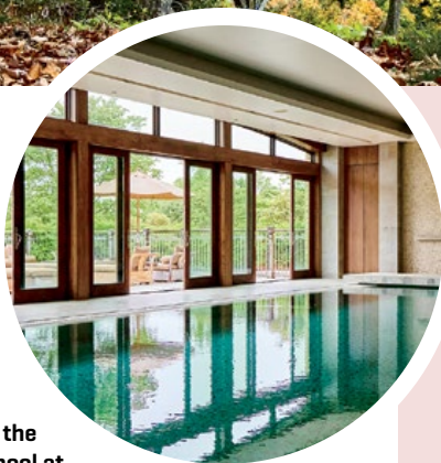
Swim in the heated pool at Primland Resort after exploring the wooded property.