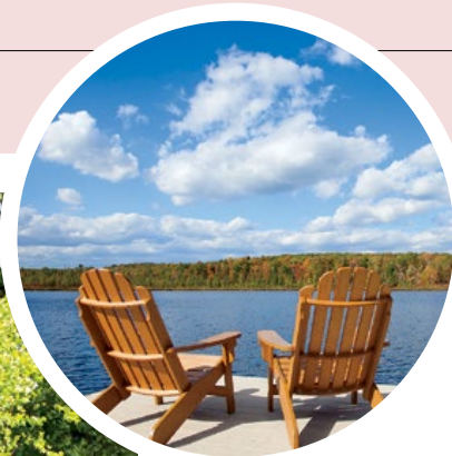
Relax by the water or in the well-appointed spa at the Lodge at Woodloch.

closer. An infinity whirlpool is heated year-round for an outdoor soak—even in winter—with views of the bucolic surroundings. For a unique bonding experience, heat up in the sauna before heading to the flurry-filled Snow Room, the only cold-therapy space of its kind in the country. Where to dine: Guests can grab a seat near the fireplace at the luxury resort's Tree restaurant, which serves a farm-to-table menu with an extensive wine list. The restaurant can also package dishes for an intimate en suite dinner or a fireside picnic on the patio. Distance from DC: 279 miles.