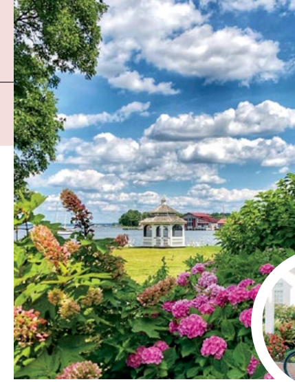
Experience romance by the shore at the Inn at Perry Cabin.

For couples who want: Massages, plush robes—and no kids around. Where to head: The adults-only Lodge at Woodloch, one of the country's best destination spas, on 500 wooded acres in the Pocono Mountains of Pennsylvania. There are 59 guest rooms, each with a private veranda and oversize marble bathroom. A romance package includes credits for the spa, sweets made in-house, and a bottle of red wine picked by the sommelier. What to do: The massive spa offers opportunities to decompress together, such as Perfectly Paired, a side-by-side aromatherapy massage in the couples suite, or a joint reiki session designed to bring duos