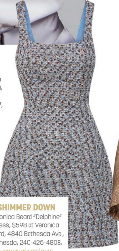
SHIMMER DOWN Veronica Beard "Delphine" dress, $598 at Veronica Beard, 4840 Bethesda Ave., Bethesda, 240-425-4808, veronicabeard.com