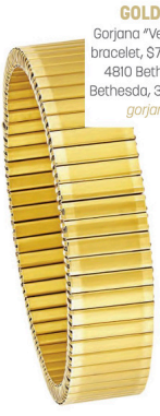
GOLD RUSH Gorjana "Venice" watch bracelet, $75 at Gorjana, 4810 Bethesda Ave., Bethesda, 301-288-1407, gorjana.com