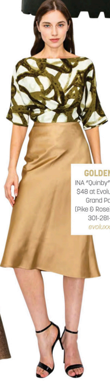
GOLDEN GIRL INA "Quinby" satin skirt, $48 at Evoluxxy, 11804 Grand Park Ave. (Pike & Rose), Rockville, 301-281-2999, evoluxxy.com