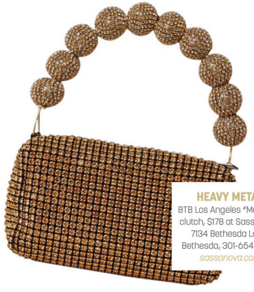
HEAVY METAL BTB Los Angeles "Marbella" clutch, $178 at Sassanova, 7134 Bethesda Lane, Bethesda, 301-654-7402, sassanova.com