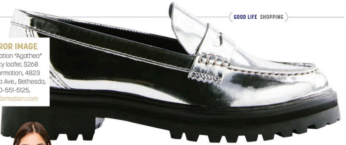
MIRROR IMAGE Reformation "Agathe" chunky loafer, $268 at Reformation, 4823 Bethesda Ave., Bethesda, 240-551-5125, thereformation.com